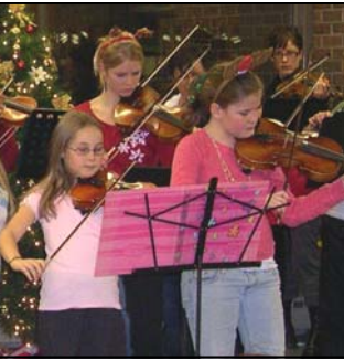
In December, library patrons were treated to a free Christmas concert by the Algoma Conservatory of Music. The library offered over 600 programs in 2007, attended by 4,728 people.