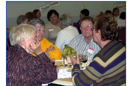
A few of the 112 volunteers who contributed over 7,000 hours to the library in 2007 are seen here enjoying the annual Volunteer Reception, sponsored by Community First Credit Union.

7,636 - the number of volunteer hours donated to the library in 2007