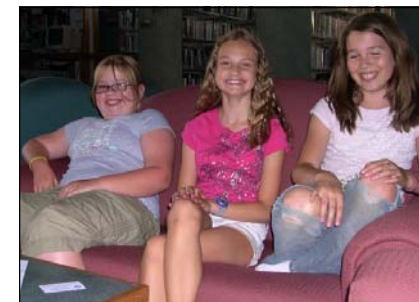
Taking a break during one of the "Midnight Madness" teen events at the Library.