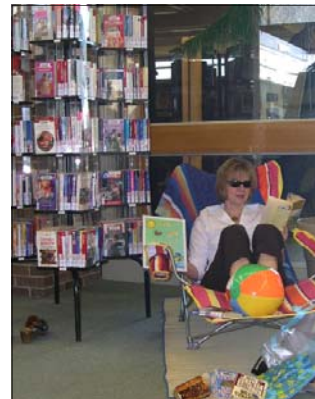
Summer Reading at the Library. Library resources were used 694,273 times in 2007.