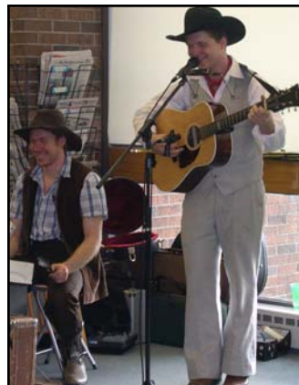
The Wild Turkeys perform at the Main