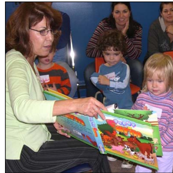
Toddler Time at the Library — a family literacy program. The support and promotion of family literacy is central to library services.