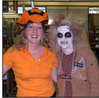
The people of Sault Ste. Marie visited a library branch 371,038 times in 2007. Those who came on Halloween found library staff had dressed appropriately for the day.